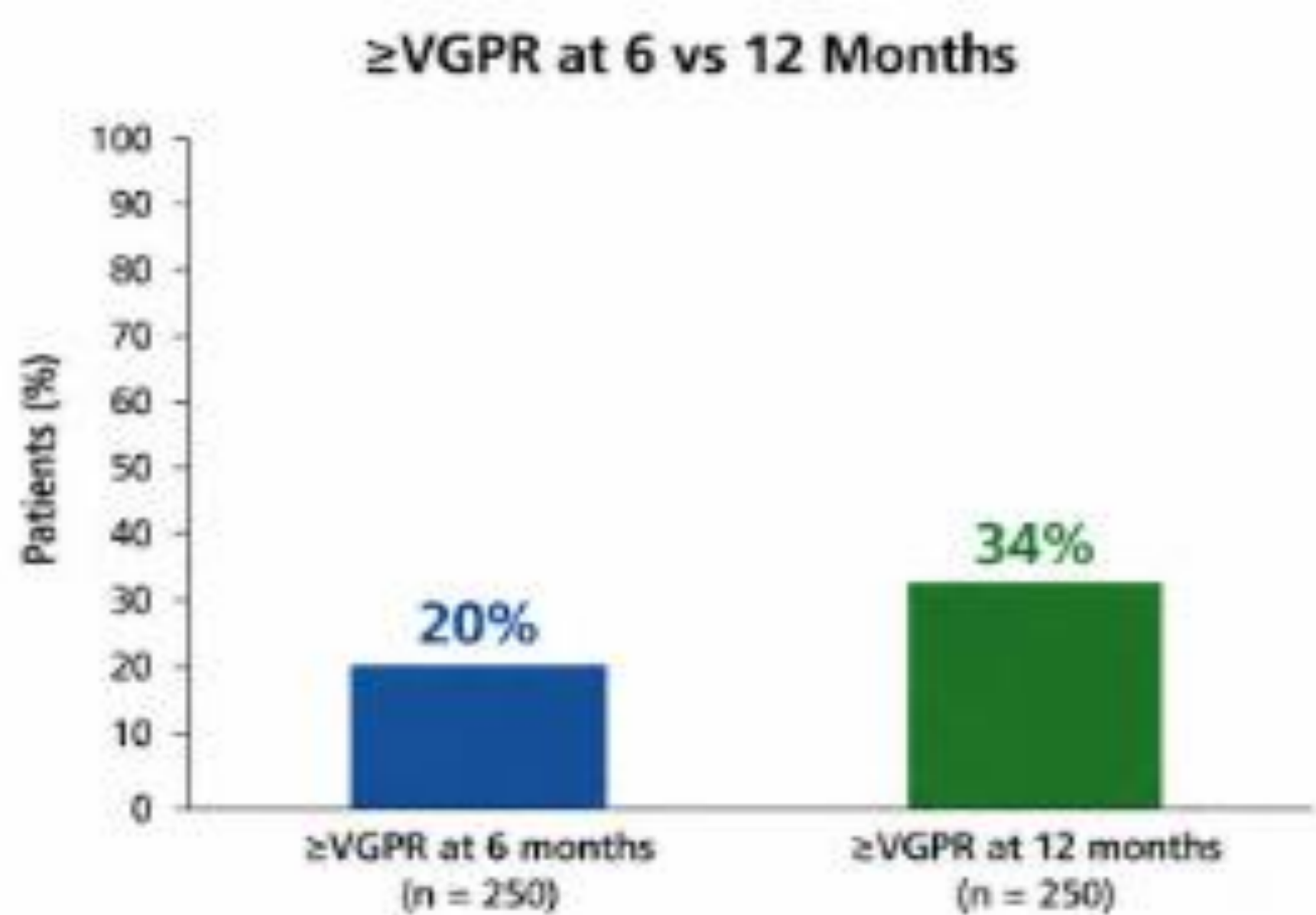
Figure 1. \geq VGPR rates over time in elderly MM patients